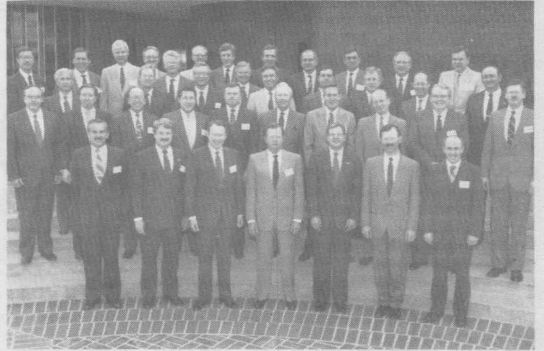
COORDINATORS CONFERENCE—Festival coordinators from the United States, Canada and other international areas meet in Pasadena Feb. 26 and 27 to plan the 1990 Feast of Tabernacles.

In afternoon workshops the coordinators learned how to feel at ease in front of a camera and make a positive impression in interviews.